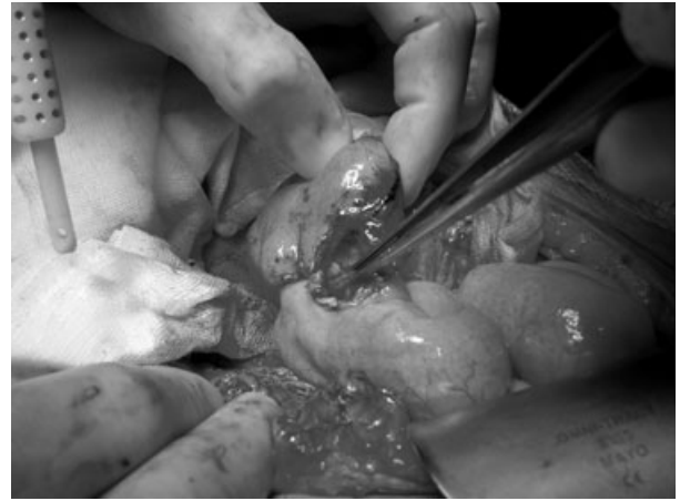
Figure 2 Check of bleeding of stapled lines before closure of enterotomy.

to construct a tension free anastomosis. This minimizes the risk of portal vein kinking and thrombosis [5].